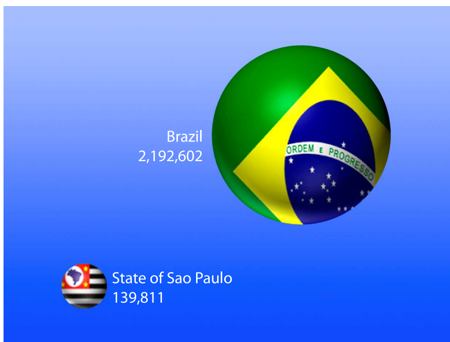
Figure 2. GHG Emissions in Sao Paulo State and Brazil in 2005 (%)